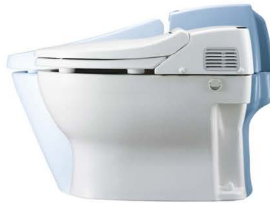
NEOREST® 600 model and the compact NEOREST® 500 model.